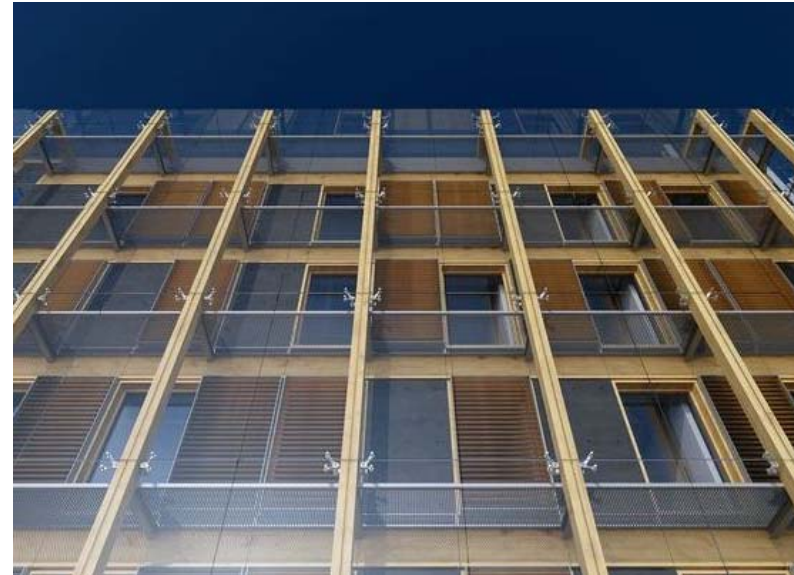
Double Skin facade

(entrance to lectures, workshop, excursion, dinner, social gathering, handouts)