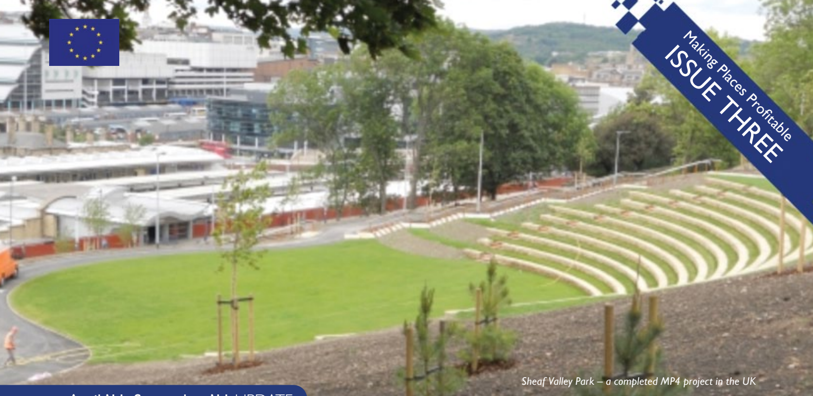
Sheaf Valley Park – a completed MP4 project in the UK