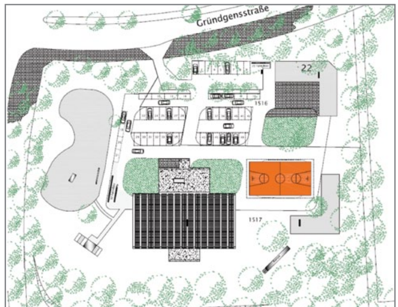
The Steilshoop Plan, soon to become a reality

This is the beginning of a very exciting project which is the brainchild of a local young people's group, GetMove. Its members want to create a whole new open space for Steilshoop's community. It will include an indoor skatepark, chill area, a space where people can hone their fitness and sports skills and an interactive website. Work will have begun on the MP4-funded basketball court by the time this newsletter is circulated, and will be complete by the end of summer. Follow its progress here at http://bit.ly/Hamburg-Steilshoop