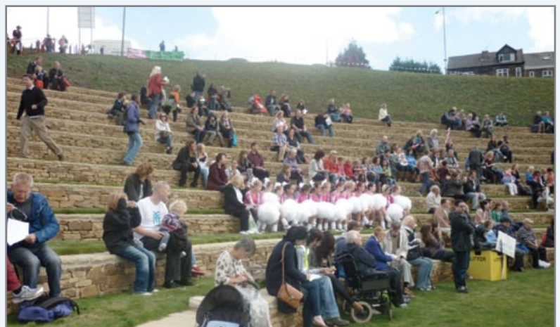
Sheaf Valley Park project launch

Arranged by Friends of Sheaf Valley and supported by South Yorkshire Forest Partnership and Sheffield City Council, the event was a real success, attended by over 400 people. For a more detailed update and photos, please visit http://bit.ly/sheafvalley