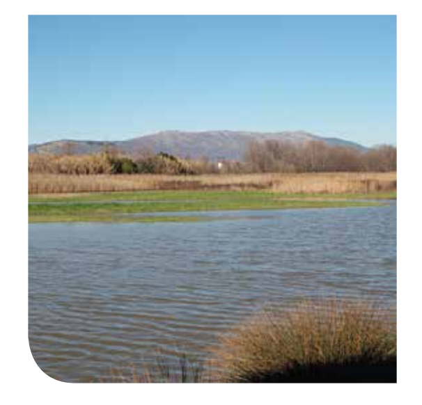
In the near future, the Council of the Tuscany Region is expected to approve adding the project of Parco della Piana to the regional planning instrument (PIT).