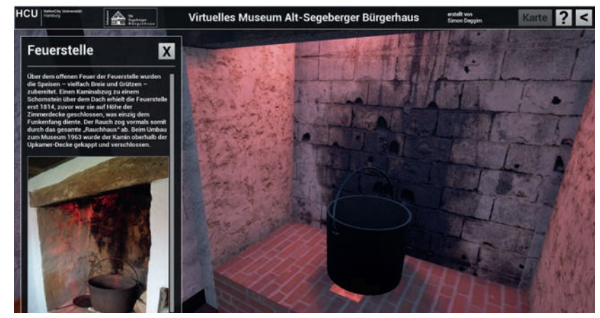
▲ Figure 3, Menu view from the final program.

The main feature of the VM is the visualisation of the construction history. Designed as a 'model within the model', the historic states of the building can be explored by walking around them and activating animations which provide an exploded view of every state of construction (Figure 4). Alternatively, individual changes in the appearance of the building can be displayed slowly, from one state to the next, accompanied by comments about the main changes during the construction period.