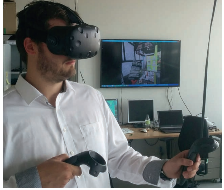
▲ Figure 5, Test demonstration of the VR application.

The VR version of the program has been demonstrated on several occasions, including at Intergeo 2016 in Hamburg. The very positive feedback showed the promising potential of such applications, which is particularly high in - but not limited to - the museum context. In theory, any application which benefits from a realistic representation