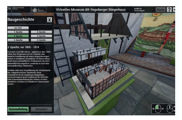
▲ Figure 4, Exploded view from the third state of construction in the menu for the building history.

The interactive part was developed using the Unreal Engine 4 game engine. Game engines provide very high performance for real-time rendering and ever-increasing support for virtual-reality systems. For the desktop version, several fixed positions were placed both inside and outside the building. Users can look around freely from any position and can switch between positions with a short animated transition or can use direct teleportation by clicking on the desired position on a miniature overview map. The interaction with the environment is provided by a total of 52 clickable information signs. Each sign opens a menu with further information about the object of interest. The menu usually includes a text and a sizable photo (Figure 3). It is also possible to implement other media such as videos and separate small 3D models within the menu.